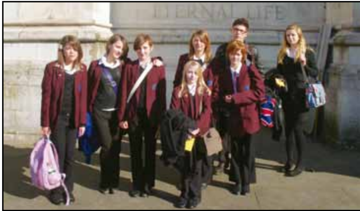
Outside Westminster Abbey

The Royal party passed only a few feet away from the Hellesdon students, who were lucky to have some of the best seats in the Abbey. Another highlight was the performance by South African jazz musician Hugh Masekela, who got the whole Abbey singing!