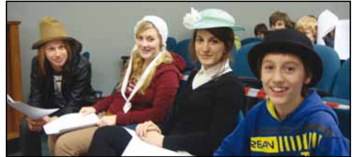
History comes alive at the Castle

As part of their GCSE controlled assessment work, Y11 spent a day at the Castle Museum. They investigated the architectural history of the building and discovered evidence of its use as a prison. They also had the opportunity to examine different types of punishment such as the scold's bridle, stocks and ducking stool.