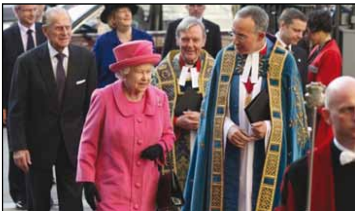
The Queen arrives at the ceremony