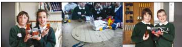
Scenes from a day of wrestling robots

19 March saw the annual Design & Technology Sumobots competition for local primary pupils. Ten teams entered, from five different schools: Kinsale, Firsides, Horsham St. Faith, Horsford and Rackheath. Each team of two pupils was challenged to build a sumo-wrestling robot, using electric motors and a selection of gears, supported by five HHS mentors from Years 7 and 8.